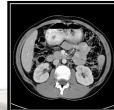
Computed Tomography (C.T. Scans)