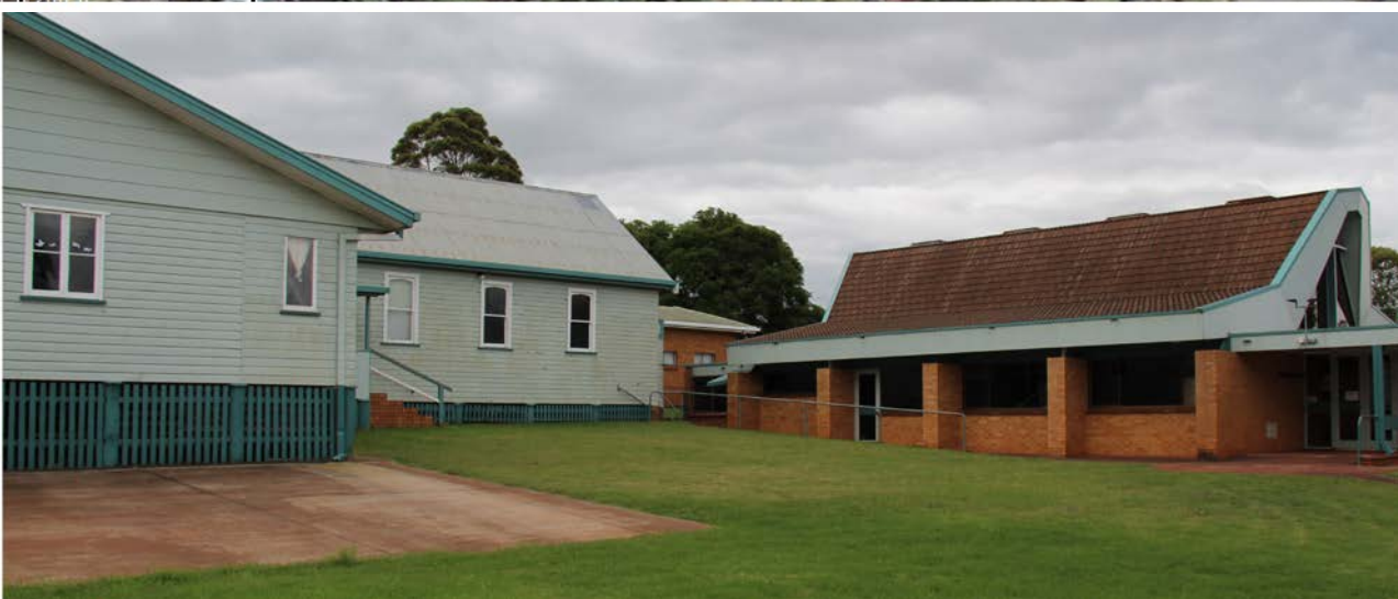
Three Buildings in the Property