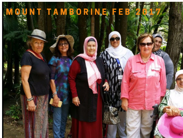
MOUNT TAMBORINE FEB 2017