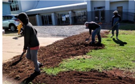
Photo: Cleaning of Mosque premises