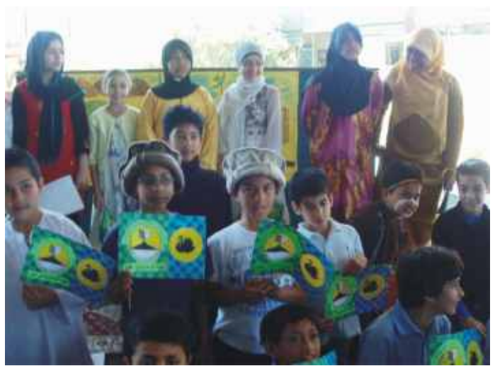
Students at Langford Islamic College