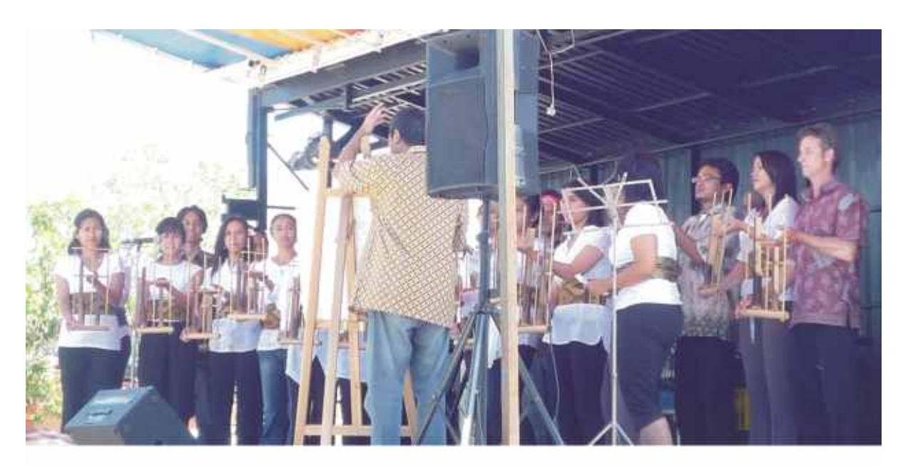
Fundraising for Indonesia & Samoa earthquake - Islamic College of Brisbane

AFIC's goal in the pursuit of excellence in education is continued, and we have experienced strong progress on our major initiatives. We are working on developing a second Islamic School in Sydney's Hoxton Park, to meet the growing demand and extremely long waiting list of students wishing to enter AFIC's prestigious Malek Fahd Islamic School, which has certainly set a standard of academic excellence for all of our schools to exemplify.