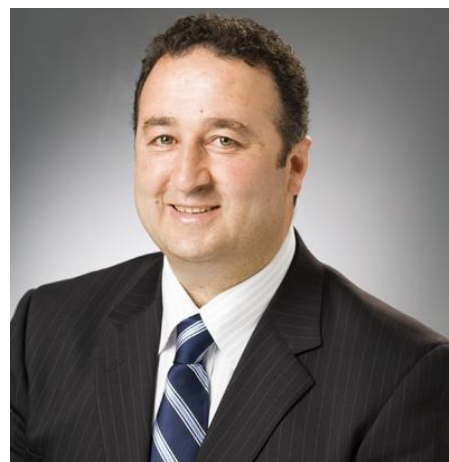
The Hon Shaoquett Moselmane MLC Member of Legislative Council Parliament of New South Wales