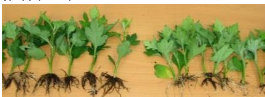
10% Worm Castings