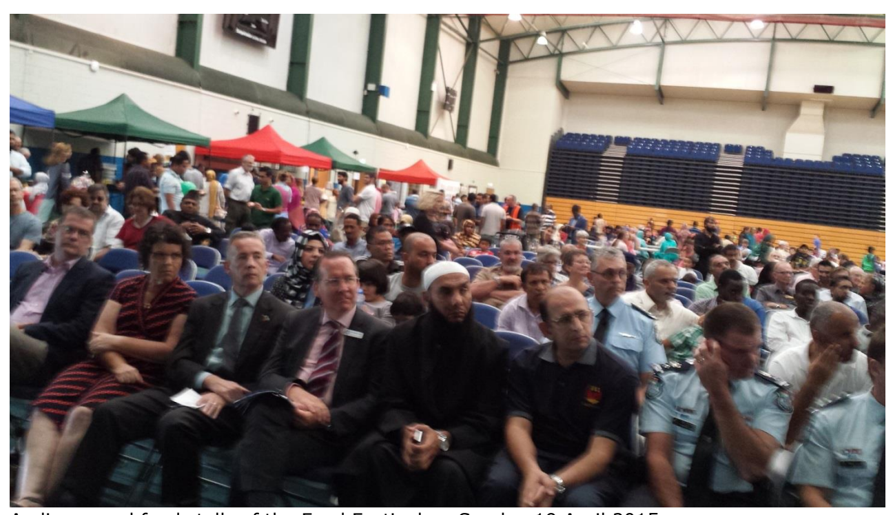
Audience and food stalls of the Food Festival on Sunday 19 April 2015.