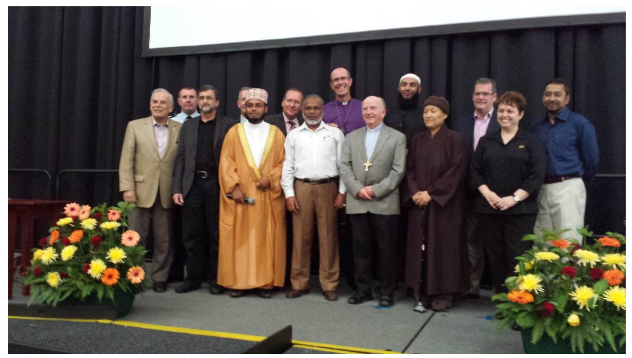
Speakers on the Open Day of Mosque