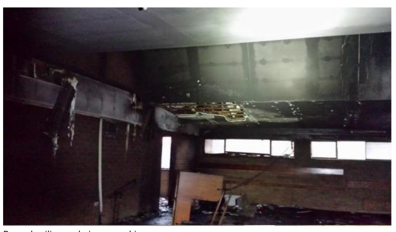
Burned ceiling and aircon machines