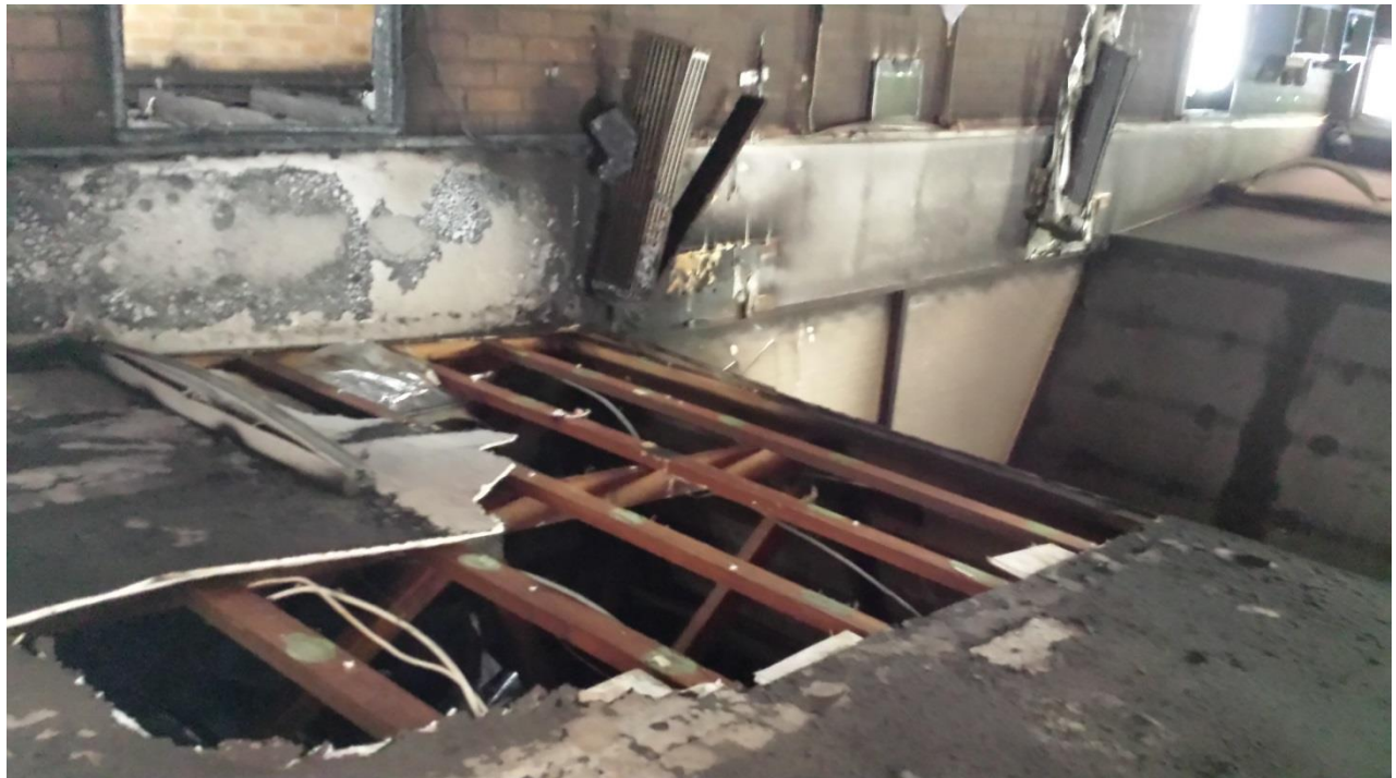
Burned roof damaging the roof