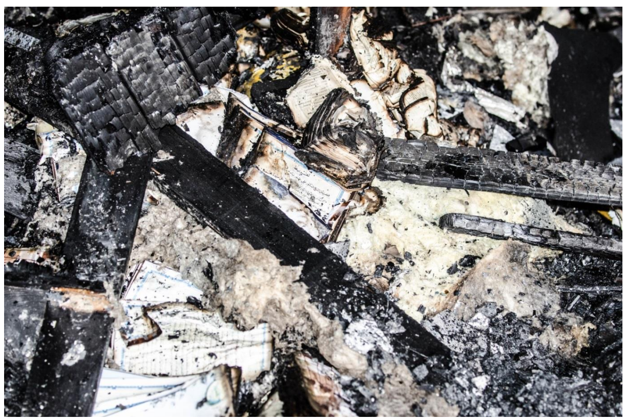
Burned to the ground