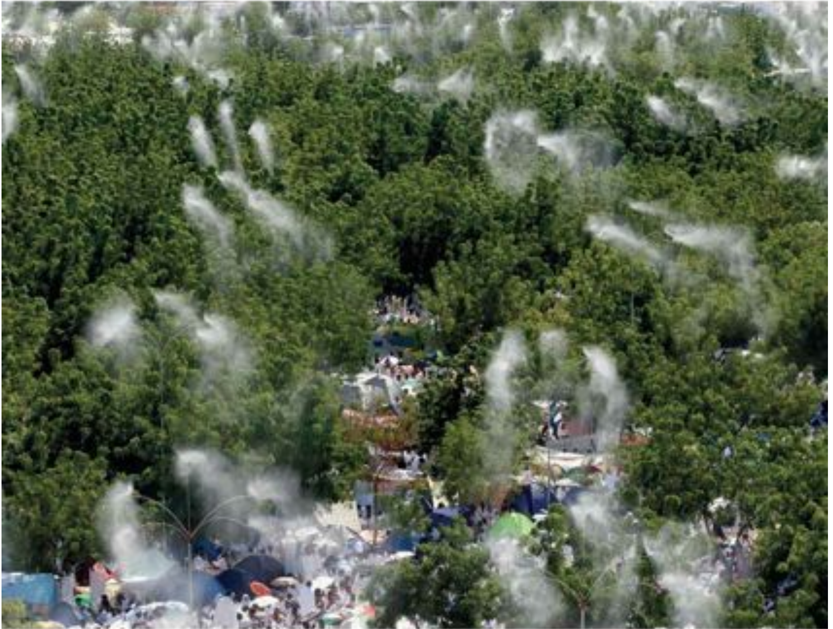
Designed by: Media and Communications, Global One 2015