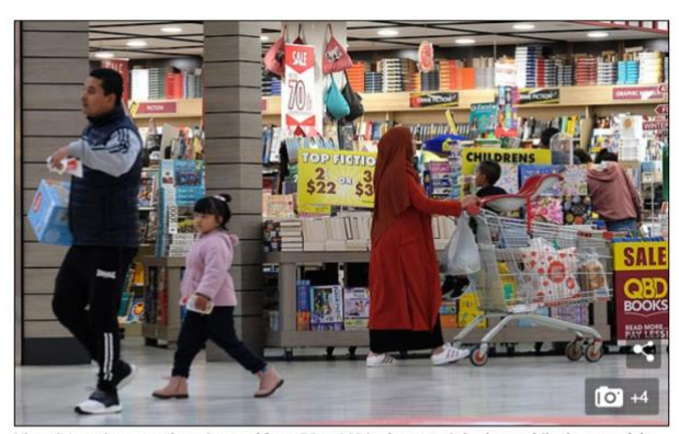
Victoria's active cases have jumped from 58 to 143 in the past eight days, while the rest of the country combined has only had 20. Pictured: Shoppers at Broadmeadows shopping centre on June 23