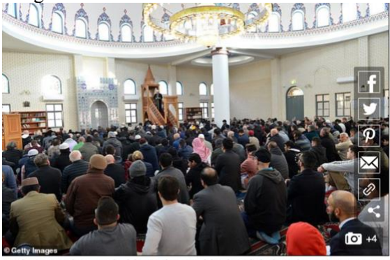
A gathering in Coburg, north of the city, last month has been linked to at least 14 cases acros nultiple households. Pictured: Muslims gather to perform the Eid Al Adha prayer at Sunshine Mosque in Melbourne, Australia on September 1, 2017. Large gatherings were cancelled in 2020 due to COVID-19