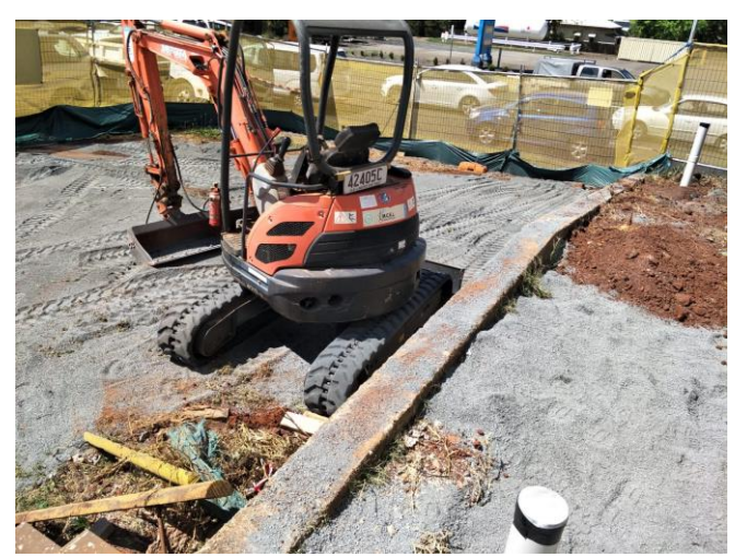
Completion of earth filling after connecting the new sewerage line.