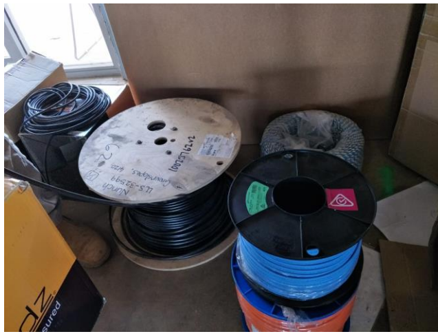
Cabling for sound system and security camera, surveillance and alarm.