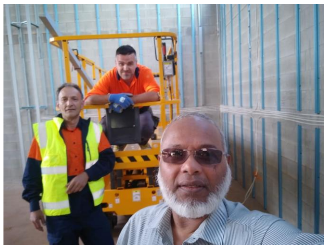
The builder working with the plasterer to fit the drop bolcet.