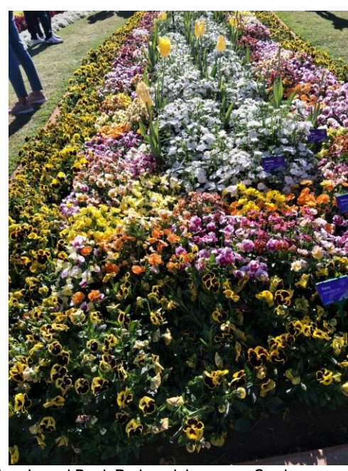
The main attractions included Botanical Garden, Laurel Bank Park and Japanese Garden.

Many Muslim visitor to the Carnival of Flowers offered their prayers in Toowoomba Mosque. We plan that in future, Toowoomba Mosque will an official visiting site during the annual Toowoomba Carnival of Flowers.