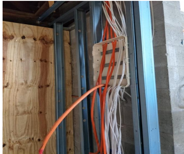
Connection of new switchboard to the main power line.